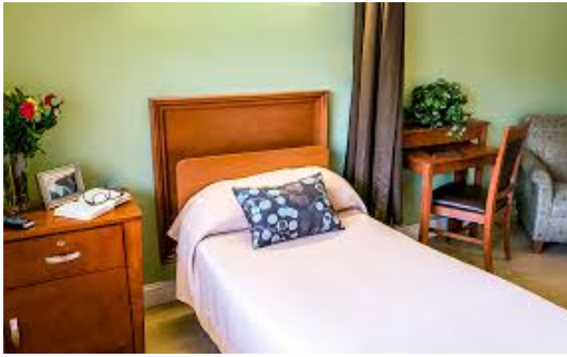
Deluxe Private Room